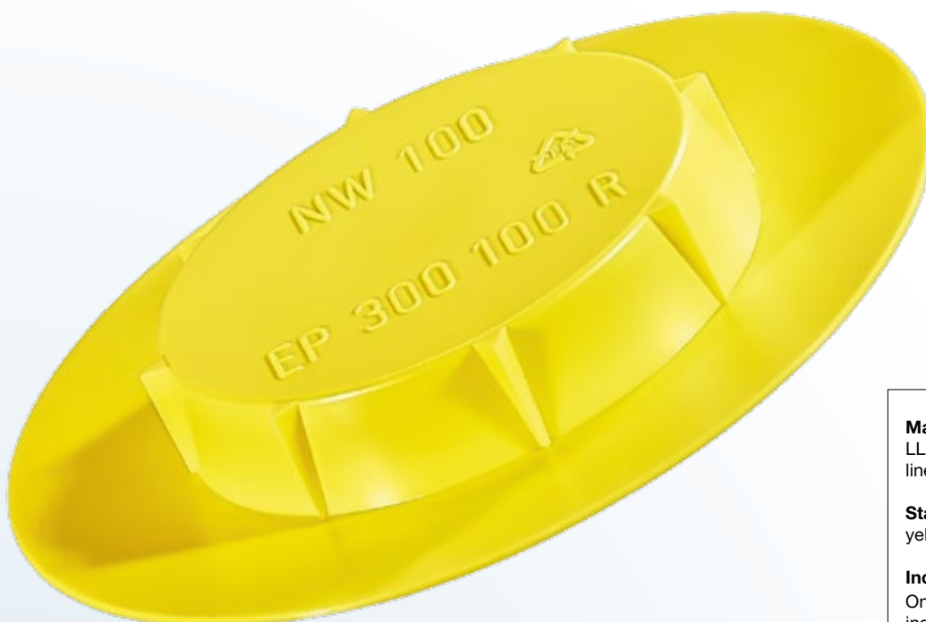
Type B (shaft with ribs)

Material : LLD-PE, linear low density polyethylene